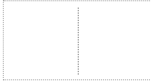
Page 02-03. Texture/ Introduction