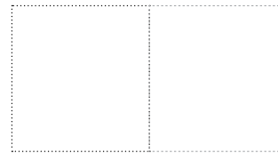
Page 40. Back Cover.